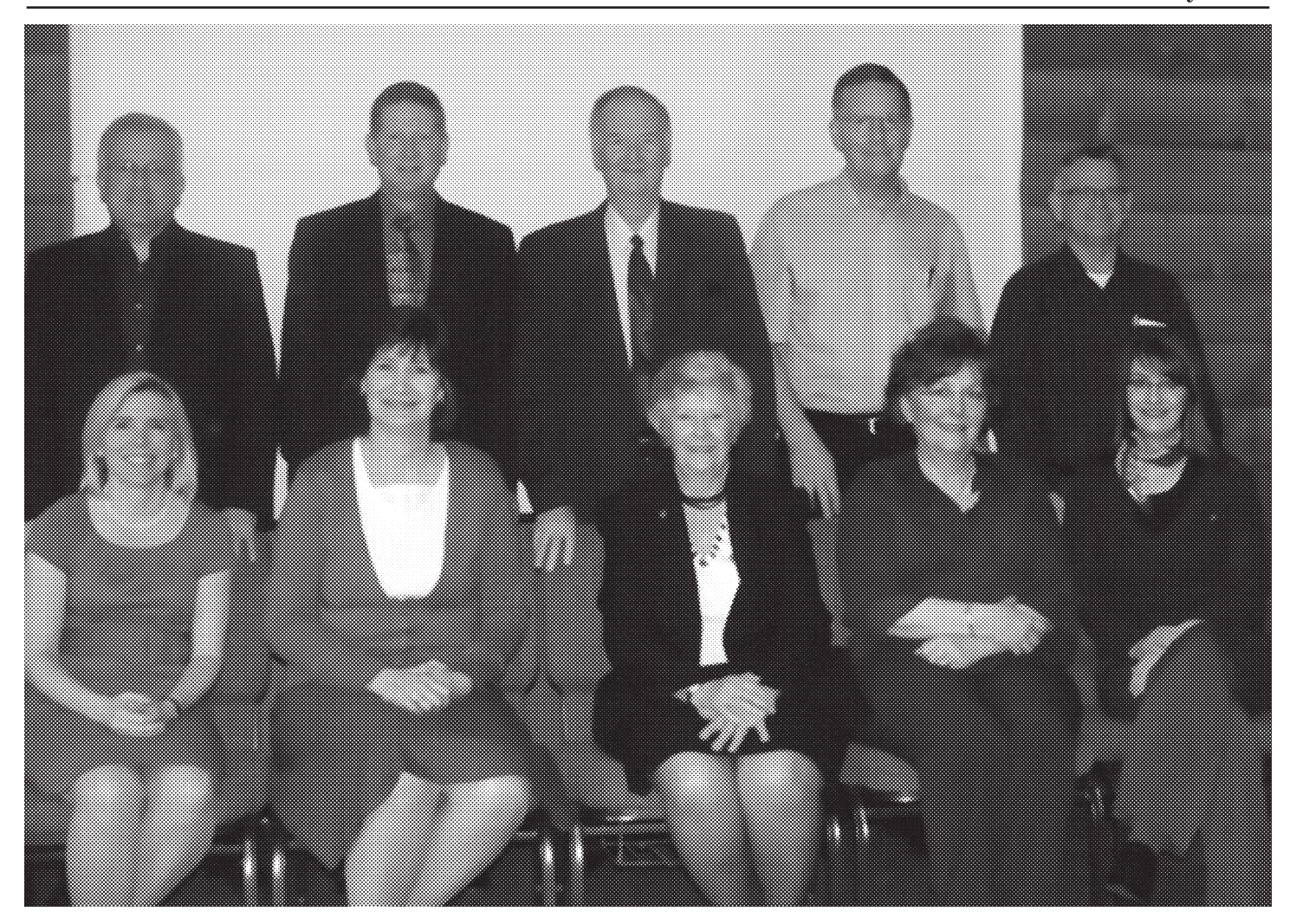
South Burnaby Church of Christ appointed two more elders on March 21, 2010.

Vol. 75, No. 5 TORONTO, ONTARIO May 2010