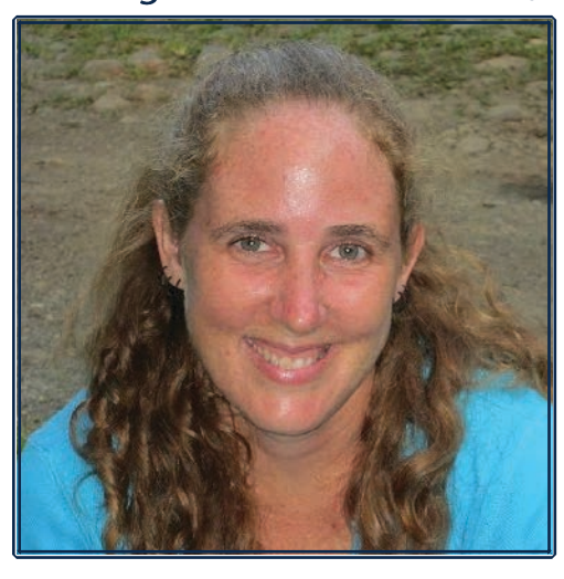
Missionary in Papua New Guinea since 2002