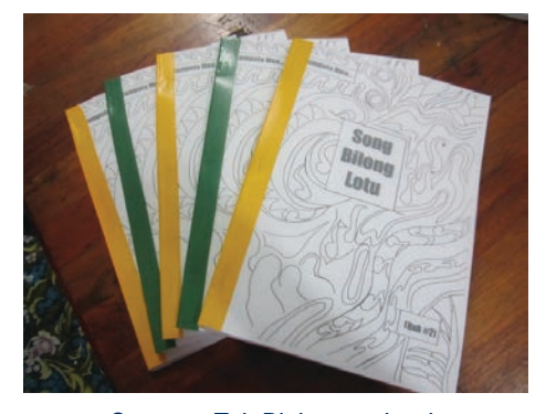
Our new Tok Pisin songbook

nal library books, is now complete and available to the students (close to five and a half years of work!!).