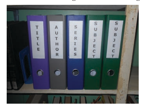
The new M.B.C. binder catalogue

In the nearly six weeks since the last report, I've made good progress with the M.B.C. library and printing. The card catalogue, for the origi-