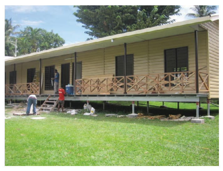
Finishing touches on the new classroom building