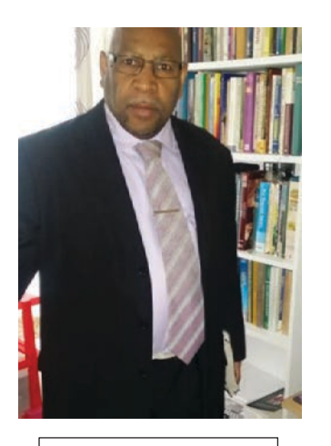
July 20-21, 2019