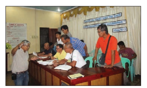
Friday night class Solano CofC

the area well. We then travelled to the school site which was on the mountains. It is only a few kilometers from the highway but the road construction going on made the trip