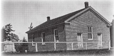
Original building at Jordan, Ontario