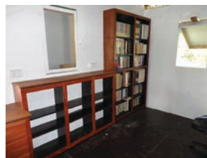
Finished shelves being transported to the library on the bike. And on the shelves!

in 2006 while I was building cabinets and had shipped to Fiji when we moved there. I used them for the desk tops. The desks and shelves are made from mahogany wood bought in Fiji at that time.