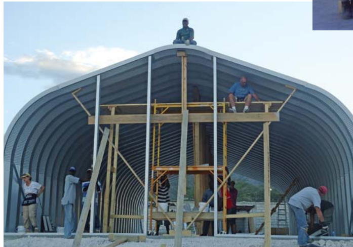
Orphanage building looking good