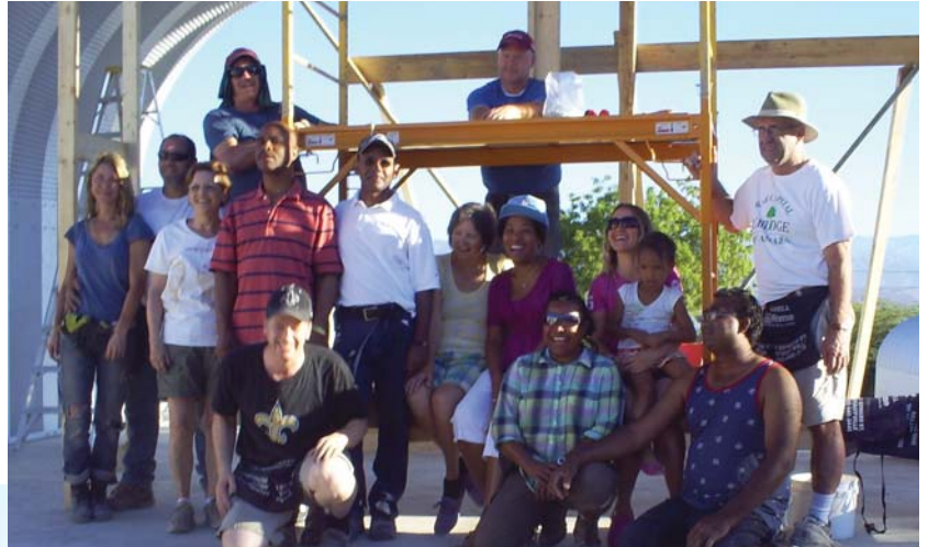
Volunteers from Canada

Thanks to God and your unfailing support, a great deal of good has been accomplished thus far and we look forward to even greater successes ahead. Please don't stop now. Despite all the hard work, we're happy to report that since