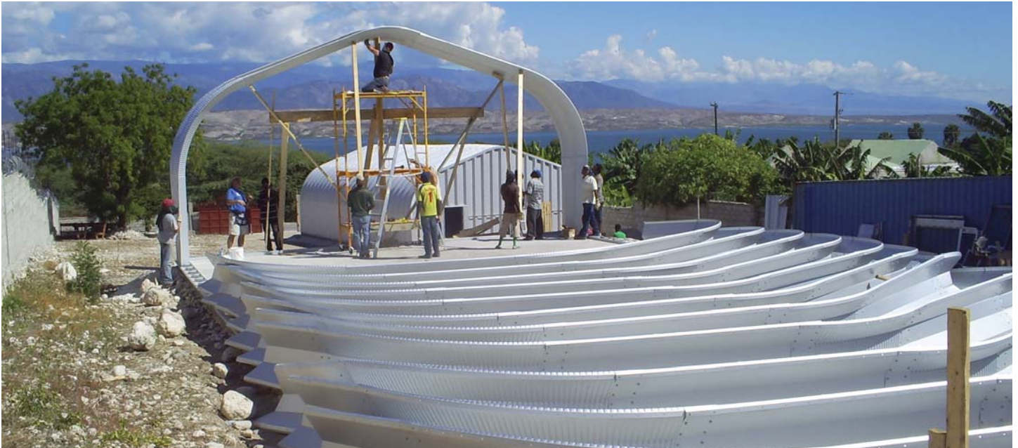
Orphanage building assembly begins

that we are deeply grateful. We are sincerely humbled by your increasing love towards us, towards the Haitian brethren and the Haitian people as a whole. Haiti has had its share of trouble through the years, but can rejoice for