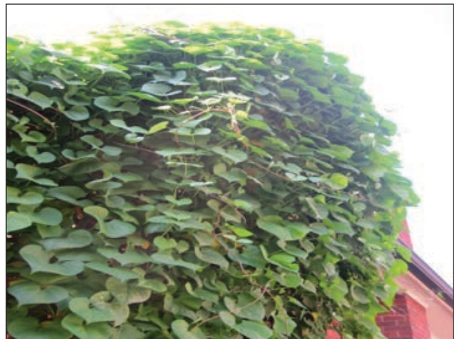
Morning Glory at home (took me 4 hours to cut it down!).

Fenwick church, as well as visiting the congregations at Vandeleur (Markdale), Bramalea, Tintern, and Beamsville, to present a report on the work happening here in Lae. I was honoured to be able to teach a ladies’ class and speak to one of the “Kids for Christ” classes at Fenwick, and to be able to speak to the students at Great Lakes Christian High School in Beamsville during one of their chapel services. In September, I enjoyed being able to attend the annual Owen Sound Ladies’ Retreat for the first time and was encouraged by the congregation’s devotion to this ministry. After a truly hectic couple of last weeks at home, I left Canada on October 15, arriving in Brisbane on the 17 after more than 36 hours of travel. The trip was uneventful except for a gap of time between clearing U.S. Customs and going through the security check area in Calgary airport to get to our gates. After being penned up like a herd of cattle for about 45 minutes (I was tempted to start “mooing”), we were informed that there had been a “Cross contamination between